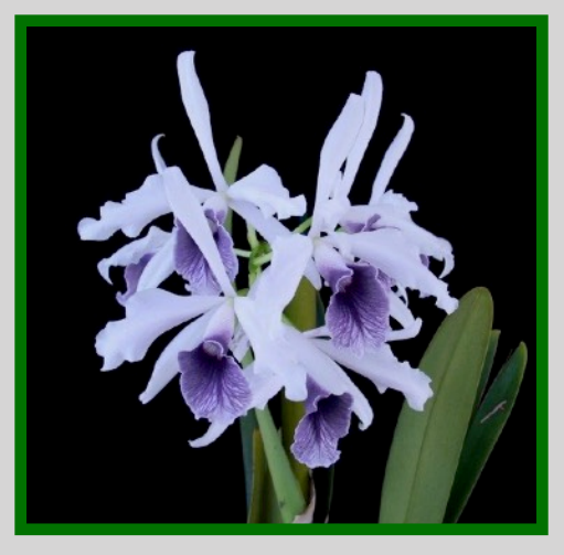
L. purpurata v. werkhauserii 'Violet Color'

July 19, 2024 Orchid Odyssey San Diego Zoo sandiegozoo.org