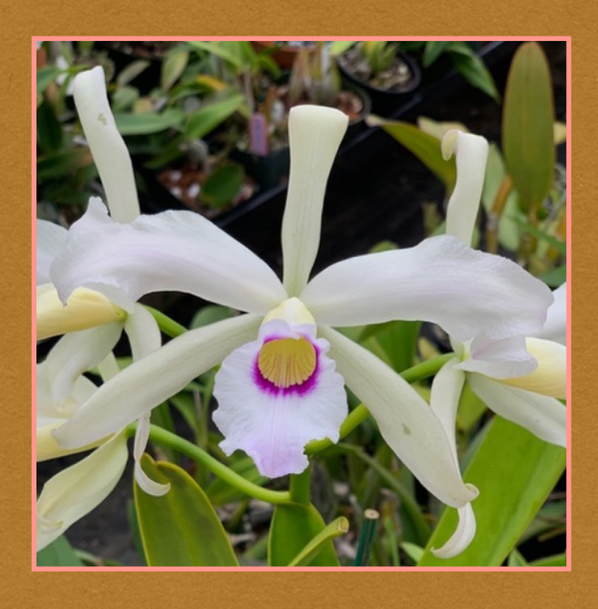
L. purpurata anelata