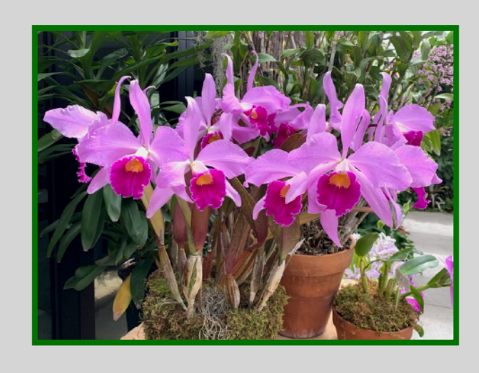
Lc. Canhamiana (C. mossiae x L. purpurata)