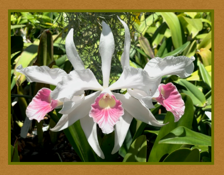
L. purpurata v. carnea 'Lady Godiva'