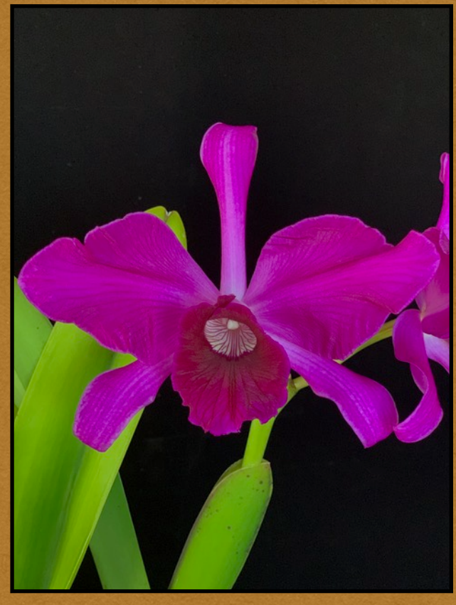
L. purpurata v. flamea x sib