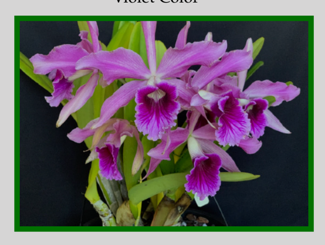
L. Pacavia 'SBOE' (L. tenebrosa x L. purpurata)