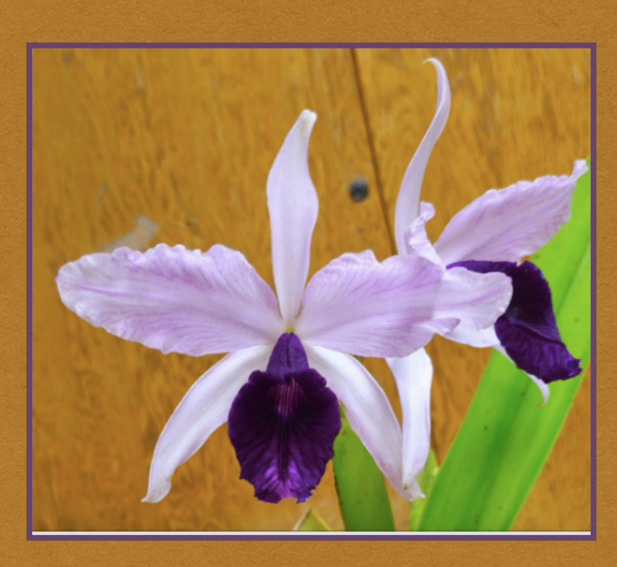
L. purpurata coerulea atropurpurata 'Yasmola'